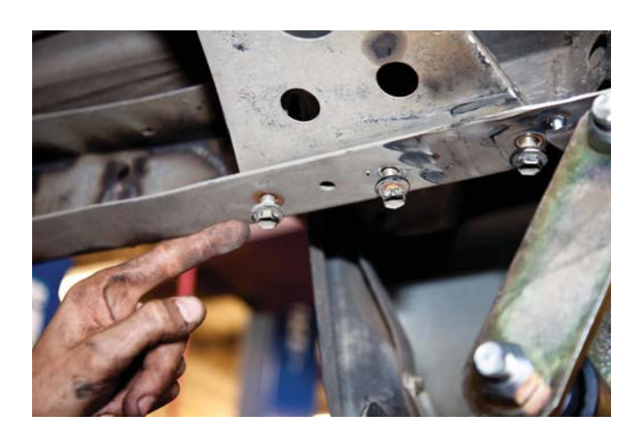
STEP 5 - REMOVE SHOCK MOUNTS Remove upper shock mounts on both sides.

Loosen and remove bolts for spare tire carrier (top and bottom).