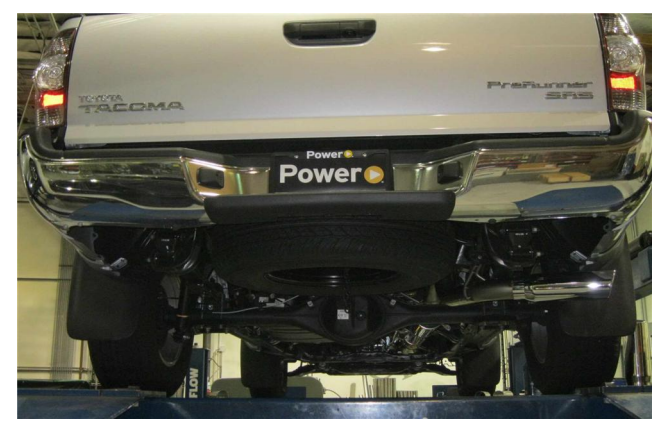
Step 5. Once a final position has been chosen for the new exhaust system, evenly tighten all clamps from front to rear using the torque specifications on page one of the instructions. Inspect all fasteners after 25-50 miles of operation and re-tighten if necessary.

MAGNAFLOW: 22961 Arroyo Vista - Rancho Santa Margarita, CA 92688 | 1(800) 990-0905 Technical Support: 1(800) 959-9226 | Email: moreinfo@magnaflow.com