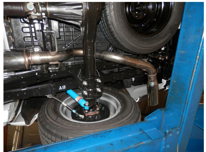
Step 4. Next use the supplied 2.50" clamp to attach the Muffler Assembly to the Inlet Pipe. Finish by attaching the Tailpipe Assembly to the Muffler Assembly with the Supplied 3.00" clamp and fitting the hangers into the insulators.