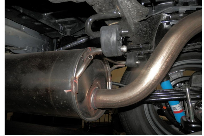
Step 2. Disengage hangers from rubber insulators and remove the OEM exhaust.

Step 1. Begin removal of the OEM exhaust system by unbolting the two bolts attaching the exhaust to the catalytic converter. Do not discard or damage the OEM fasteners or rubber insulators as they will be used to install the new system.