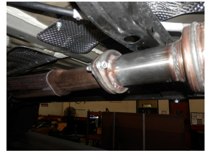
Step 3. Begin installation of your new MAGNAFLOW system by attaching the Inlet Pipe Assembly to the catalytic converter outlet using the OEM fasteners and insulator. Keep all fasteners and clamps loose until final adjustment.