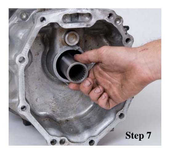
Slide coupler into place on the back of the transmission.