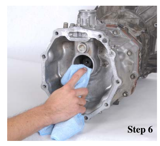
Using degreaser, clean the rear transmission seal surface.