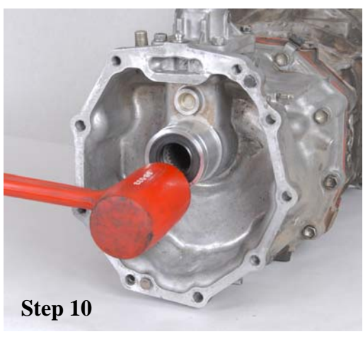
Install Seal Adapter into rear of transmission. Gently seat seal adapter into place using rubber mallet