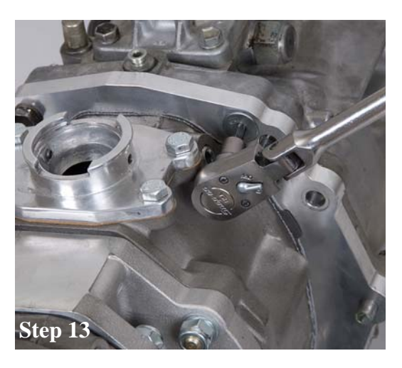
The second allen head bolt should be installed in position shown on the upper right (passenger) side.