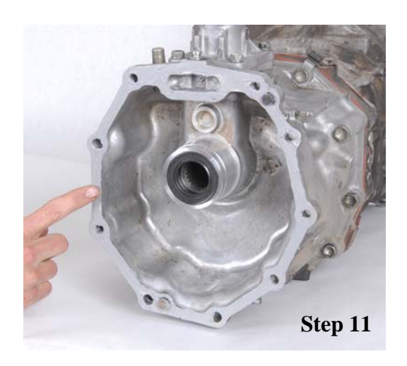
Step 11: Apply silicone to rear face of transmission