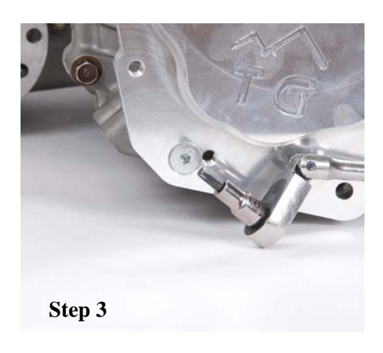
Install M-10-1.25x30 allen head bolt using blue Loc-Tite® torque to 30 ft. lbs.