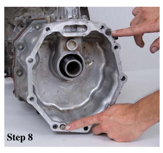
Ensure two dowels are in place in the transmission. If dowels are in the transfer case move them to the transmission.