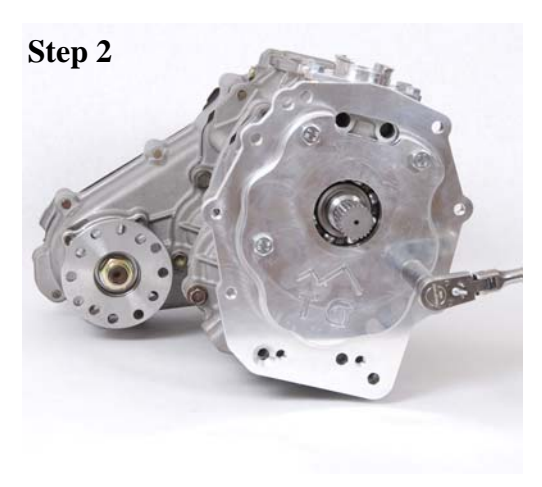
Install adapter plate on face of transfer case, using 4 M10-1.25x35 bolts (provided). We recommend applying blue LocTite® to threads before installation. Torque four plate bolts to 30 ft. lbs.