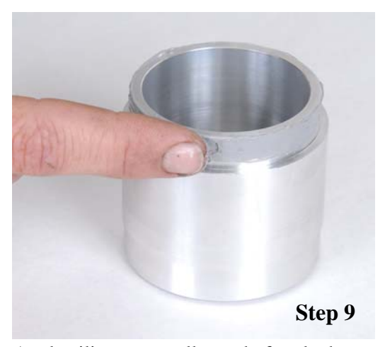
Apply silicon to smaller end of seal adapter