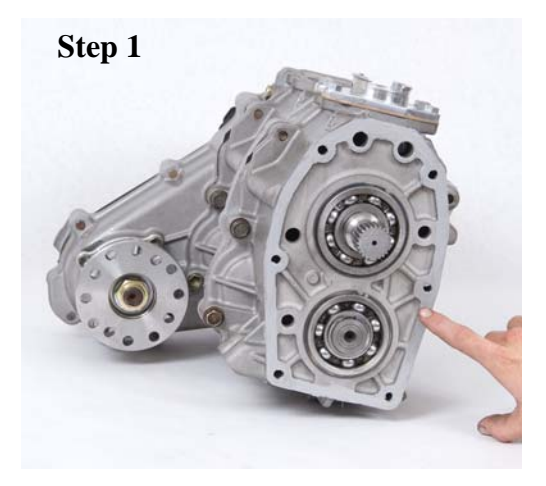
Apply silicone to face of single or dual transfer case assembly.