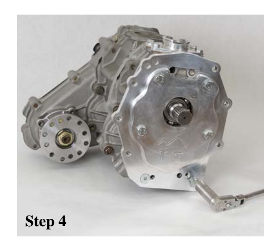
Install M-10-1.25x 35 bolt using blue LocTite \mbox{\ensuremath{\mathbb{B}}} torque to 30 ft. lbs.