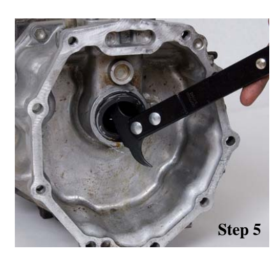
Remove rear transmission seal using a seal remover or claw hammer.