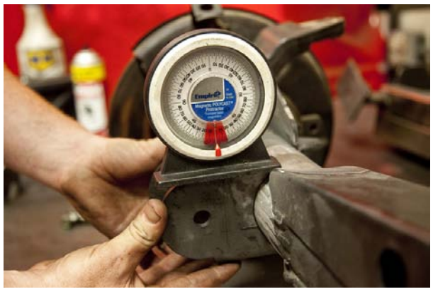
STEP 8 - LOCATION OF UPPER LINK BRACKET

Slide the upper link bracket in place between the front cab body mount and the skid plate on the passenger side. Some grinding may be required.