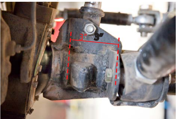
STEP 7 - LOWER LINK FRAME BRACKET

Mark axle 3 inches in from flange on each side. Place the outside of the Lower Link bracket on the line and level them to the axle. This will place the link brackets level at ride height with the desired pinion angle. Tack weld them in place. If you are using a Rock Assault housing, place the brackets against the weld on the drop flange. Approx 3" from the knuckle ball flange.