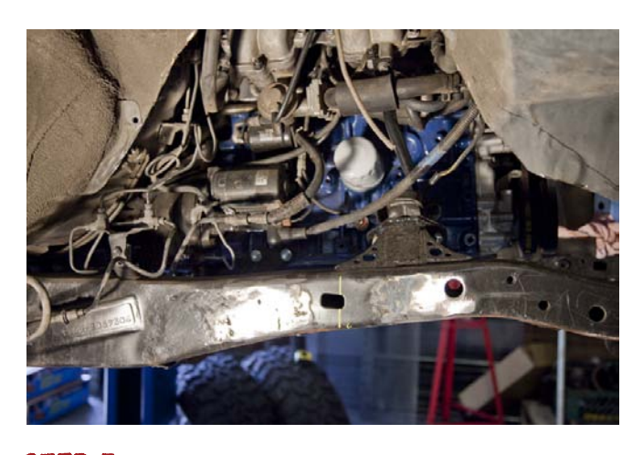
STEP 5 - AXLE BRACKET INSTALL

Remove axle, cut off front suspension of the truck, and grind smooth.