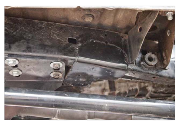
STEP 10 - UPPER LINK INSTALL

Slide the upper link bracket in place between the front cab body mount and the skid plate on the passenger side. Some grinding may be required.