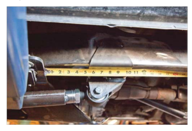
STEP 9 - LOWER LINK INSTALL

Mount the Upper and lower link mounts to the frame. Depending on the model of truck these locations will vary.