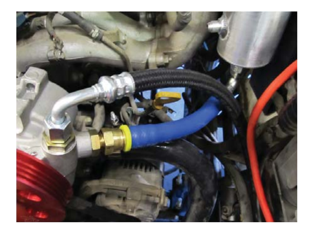
STEP 19 Route the hoses through a hole in the radiator support.