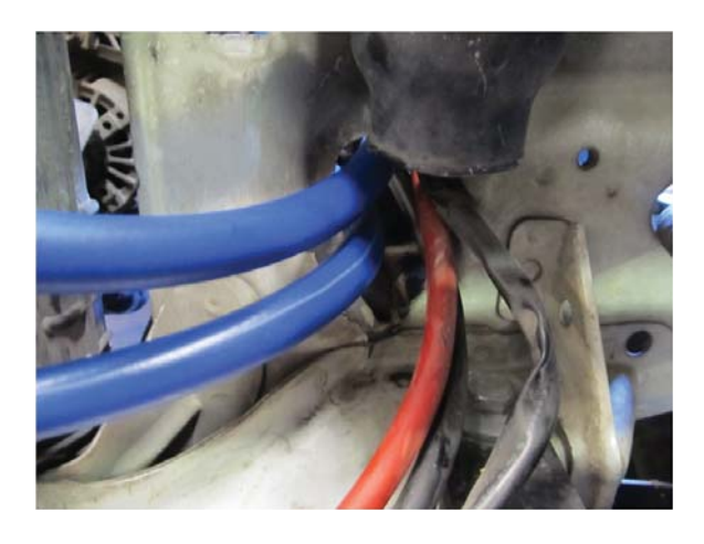
STEP 21 Route lower hose to power steering reservoir