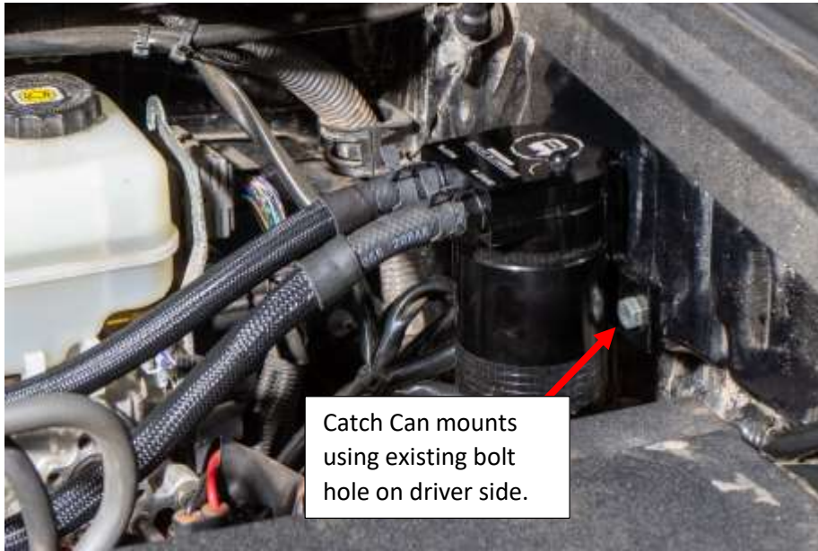
Catch Can mounts using existing bolt hole on driver side.