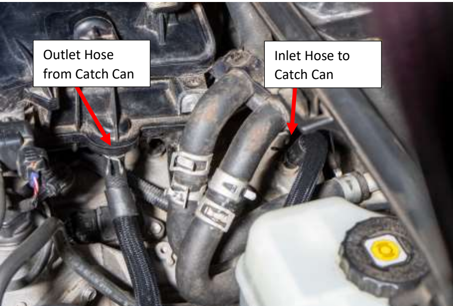
Outlet Hose from Catch Can